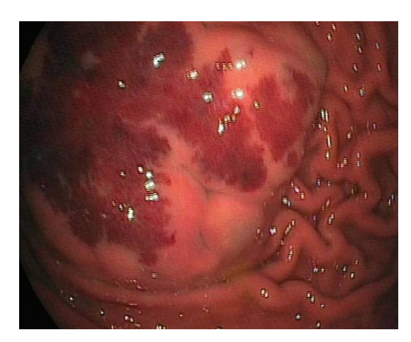
Figure 1. Endoscopic view of submucosal tumour of stomach showing lobulated submucosal tumor with dense vascularity.

A 25-year-old male with a history of intermittent abdominal pain for the last six months was admitted to our emergency department complaining of intractable postprandial abdominal pain, along with bloody vomiting. Having been subject to a preliminary evaluation in our emergency department, the patient was transferred to the gastroenterology clinic for further investigation and treatment, where oral intake was stopped and replaced with parenteral replacement therapy. The patient's medical background revealed nothing remarkable other than recurrent epigastric pain. He also had a history of receiving proton pump inhibitor drugs on an irregular basis. Upon physical examination, his general clinical status was good, with stable vital parameters. A palpable mass of 5 × 5 cm, along with tenderness in the epigastric region