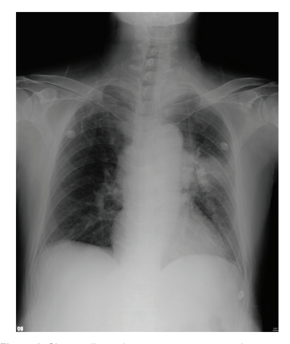
Figure 1. Chest radiography on emergency room shows a soft tissue density mass at left upper lobe with prominent soft tissue density at left apex and left lower neck.

A 73-year-old man was admitted to our emergency department with complaining of repeated syncope in two days. Prodromal symptoms of light headache and diaphoresis prior to the episodes were told. He regained consciousness spontaneously followed by brief conscious loss without mental impairment. The events occurred on his toilet in the fist