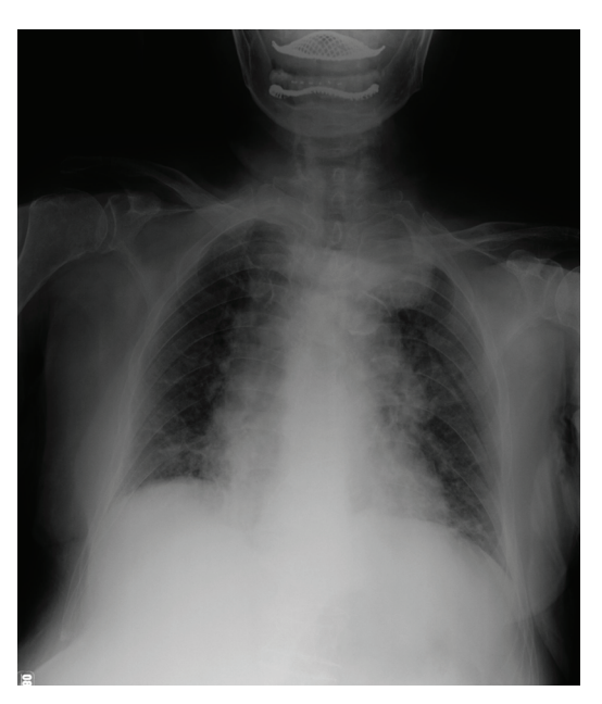
Figure 3. Chest radiography shows a soft tissue lesion at left apex.

enous enhancement at left lower lobe near hilum with extensive lymphadenopathy at left hilum, left paraaortic, anterior mediastinum with left paratracheal extending to left lower neck. The lymph nodes caused obstruction of left upper lobe