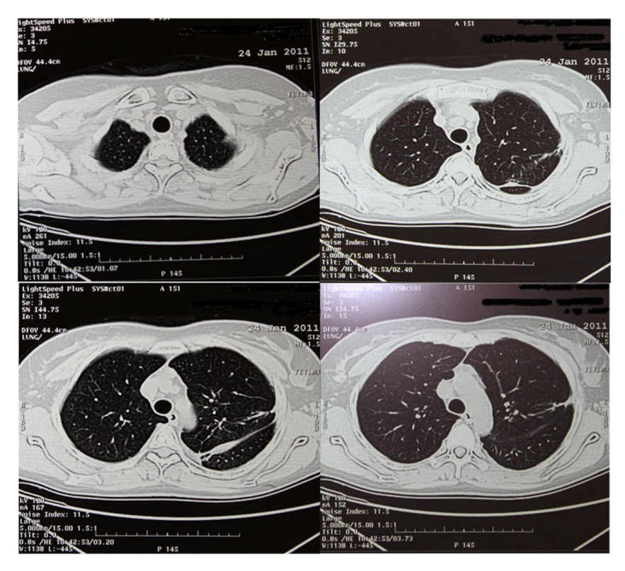
Figure 3. CT scan at follow up (4 months postoperatively).