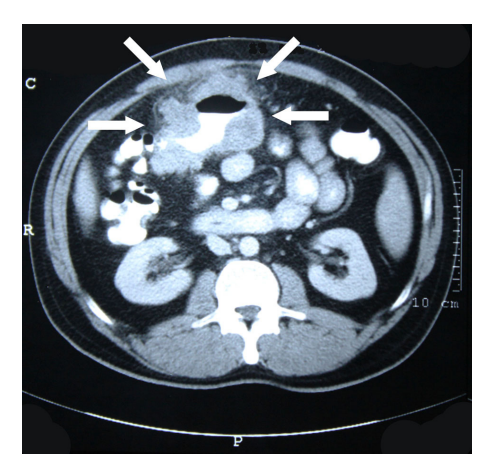
Figure 1. Invasive tumor at the level of transverse colon.

HNPCC are critically important for their familial transition, early onset, poor differentiation hystologically and higher frequency of syncrone and metacron relatively [2]. Although