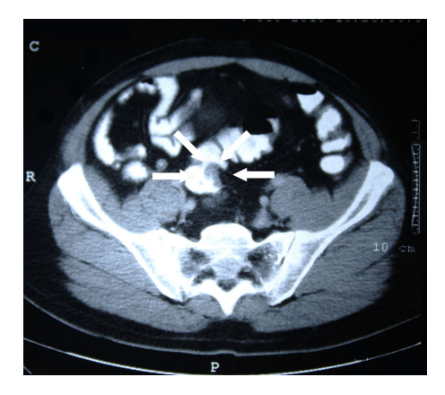
Figure 2. Polypoid tumor in rectosigmoid region.