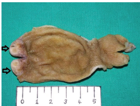
Figure 1. A white, firm hemispheric mass containing microcysts in the fundal region of the gallbladder (black arrows).

addition to cholelithiasis. Two patients complaining of acute abdominal pain and nausea were clinically and radiologically diagnosed as cholelithiasis in emergency department of our university hospital. The other case was diagnosed as cholelithiasis and adenoma of the gallbladder via abdominal examination and ultrasound findings in the research and training hospital. Laparoscopic cholecystectomy was performed on all the patients.